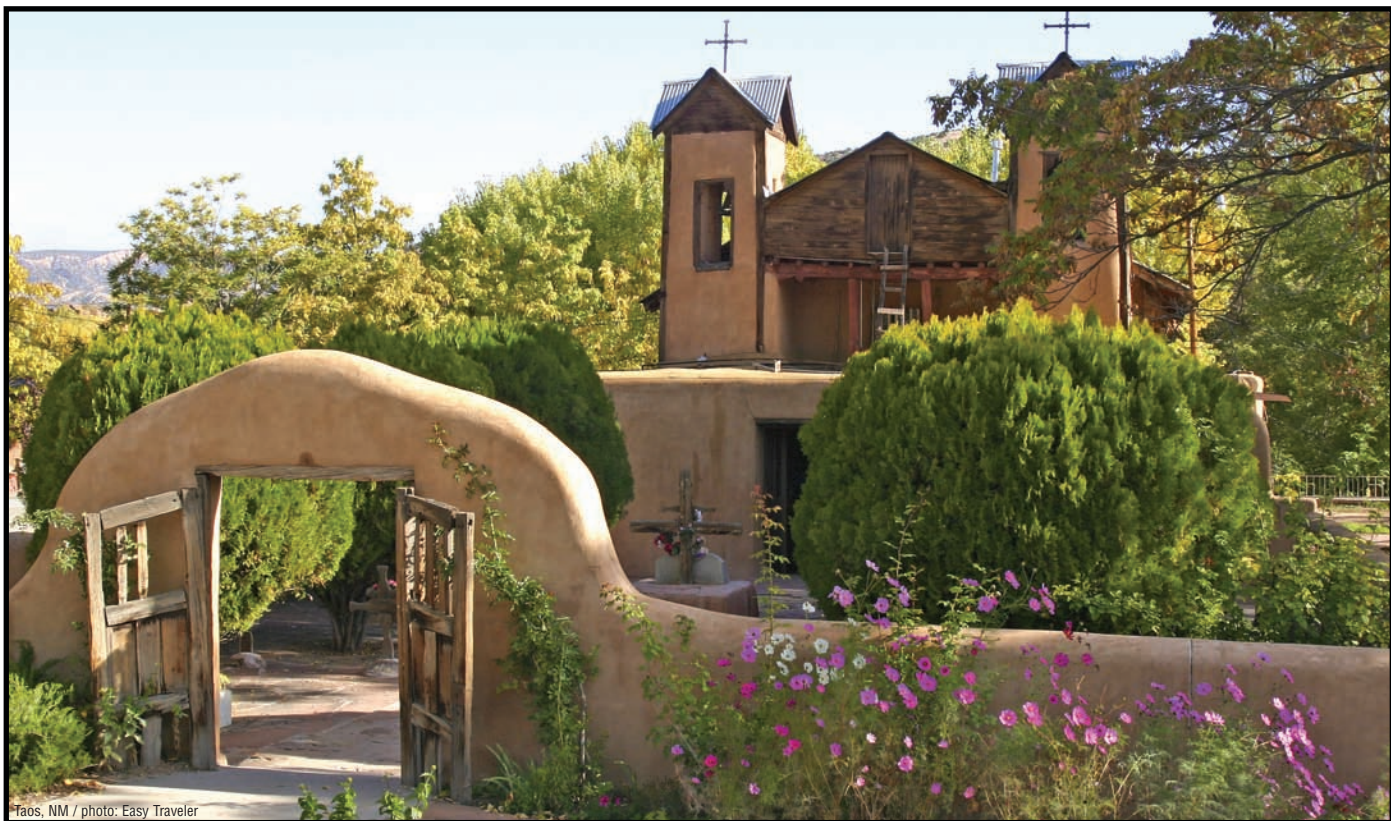
Taos, NM

*Visit your favorite arts destination! All ballots (online and mail-in) received by February 26, 2010, will be entered to win a $500 travel certificate. Odds of winning are based on number of contestants. Prize winners are drawn at random. All decisions are final. Employees and families of employees of The Rosen Group and AmericanStyle magazine are prohibited from participation.