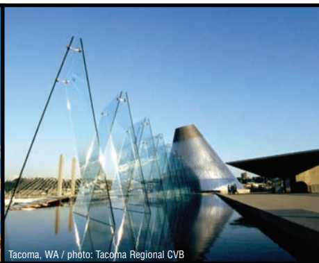
Tacoma, WA

Vote for your favorite arts destination!