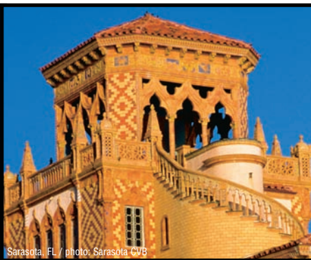
Sarasota, FL